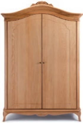
Wide Fitted Wardrobe H:204 W:140 D:65 CR/30170