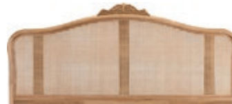
Headboard 135cm | H:72 W:140 L:5 | CR/30310 150cm | H:72 W:155 L:5 | CR/30320 180cm | H:72 W:185 L:5 | CR/30330