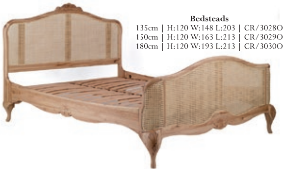
Bedsteads 135cm | H:120 W:148 L:203 | CR/30280 150cm | H:120 W:163 L:213 | CR/30290 180cm | H:120 W:193 L:213 | CR/30300