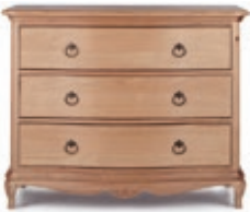
3 Drawer Chest H:85 W:109 D:53 CR/30200