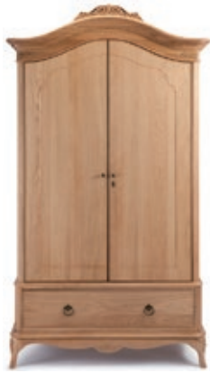
Double Wardrobe H:204 W:110 D:65 CR/30180