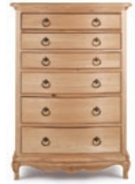
6 Drawer Chest H:122 W:85 D:53 CR/30190