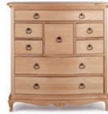
8 Drawer Chest H:112 W:109 D:53 CR/30210