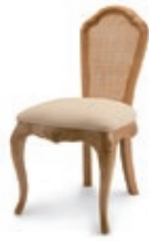
Bedroom Chair H:90 W:51 D:56 CR/30260