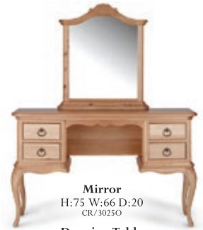
Mirror H:75 W:66 D:20 CR/30250 Dressing Table H:78 W:129 D:49 CR/30240