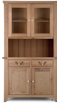
2 Door Glazed Top H:114 W:106 D:35 GS/7295L