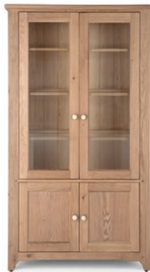
Tall Glazed Display H:190 W:106 D:40 GS/7296L