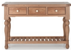
Console Table H:76 W:117 D:40 GS/7281L