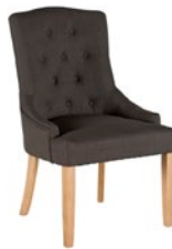
Paris Dining Chair H:103 W:59 D:63 Charcoal DN/5673N Camel DN/5672N