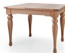
Small Extending Dining Table H:77 W:130-175 D:80 GS/7289L