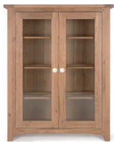
Low Glazed Display H:136 W:106 D:40 GS/7297L