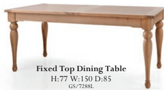
Fixed Top Dining Table H:77 W:150 D:85 GS/7288L