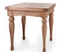
Flip Top Dining Table H:76 W:80-160 D:80 GS/7299L

Exquisitely fashioned from solid Oak and Oak veneers, Gloucester exudes classic sophistication whilst boasting a modern twist on traditional country styling. Crafted with a turned leg on the dining table and living pieces and beautifully finished with ivory coloured handles, this highly versatile range is ideal for both formal and casual dining.