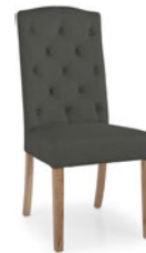
Stanza Button Back Dining Chair H:103 W:47 D:52 Charcoal GS/7275L