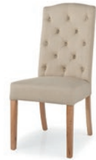
Stanza Button Back Dining Chair H:103 W:47 D:52 Camel GS/7276L