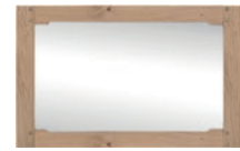
Wall Mirror H:70 W:110 D:3 GS/7285L