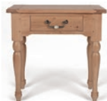
Hallway Table H:77 W:78 D:43 GS/7284L