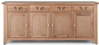
4 Door Sideboard H:84 W:184 D:45 GS/7290L