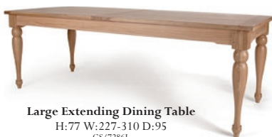
Large Extending Dining Table H:77 W:227-310 D:95 GS/7286L