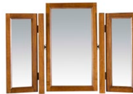
Gallery Mirror H:68 W:96 D:20 LI/8573L