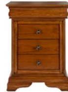
3 Drawer Bedside H:70 W:50 D:42 LI/8566L