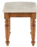
Stool H:49 W:43 D:43 LI/8572L