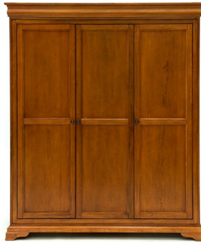
Triple Fitted Wardrobe H:197 W:163 D:64 LI/8567L