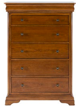
Tall 6 Drawer Chest H:133 W:90 D:50 LI/8574L