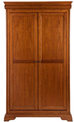
All Hanging Wardrobe H:197 W:117 D:64 LI/8568L