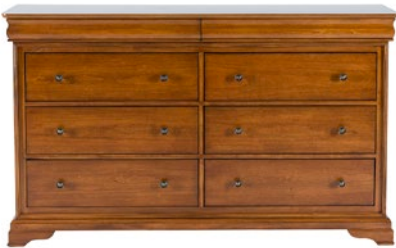
4+4 Drawer Chest H:91 W:160 D:48 LI/8569L