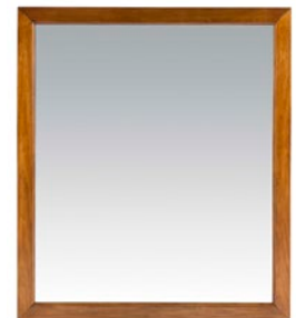
Wall Mirror H:110 W:90 D:3 LI/8576L

A fresh finish formed from solid Poplar and Cherry veneer finds this classic W&G range revived. Available in a light brandy mid tone finish, giving Louis Philippe a new start as its warmth of character and timeless sophistication springs back into life.