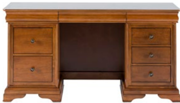
Dressing Table H:77 W:150 D:48 LI/8571L