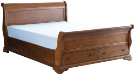
End Storage Bedstead 135cm | H:102 W:149 D:220 | LI/8563L 150cm | H:102 W:164 D:220 | LI/8564L 180cm | H:102 W:195 D:220 | LI/8565L