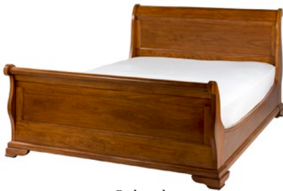
Bedstead 150cm | H:102 W:164 D:220 | LI/8561L 180cm | H:102 W:195 D:220 | LI/8562L