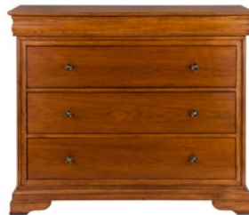
4 Drawer Chest H:91 W:115 D:48 LI/8570L